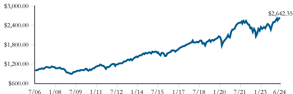
— North State Total Fund - Gross