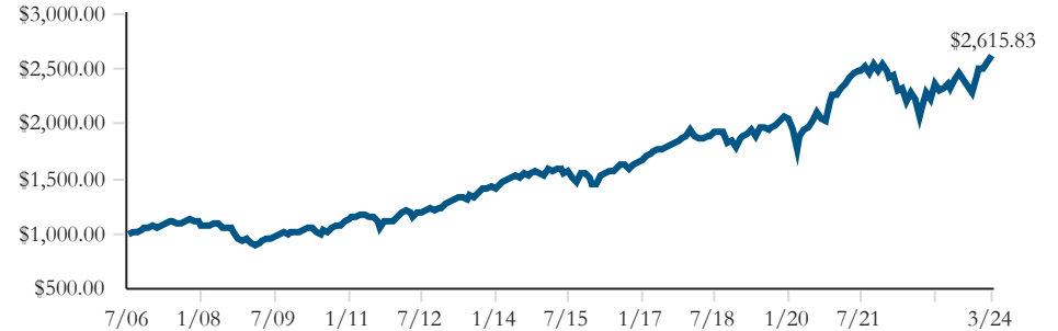
— North State Total Fund - Gross